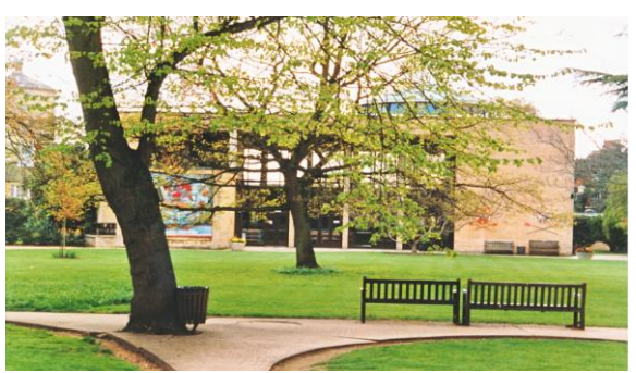
St Anne's College, Oxford.